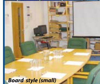
Board style (small)