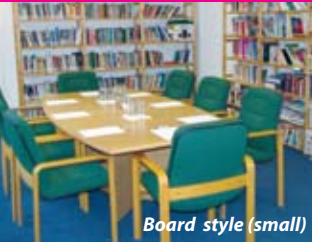
Board style (small)